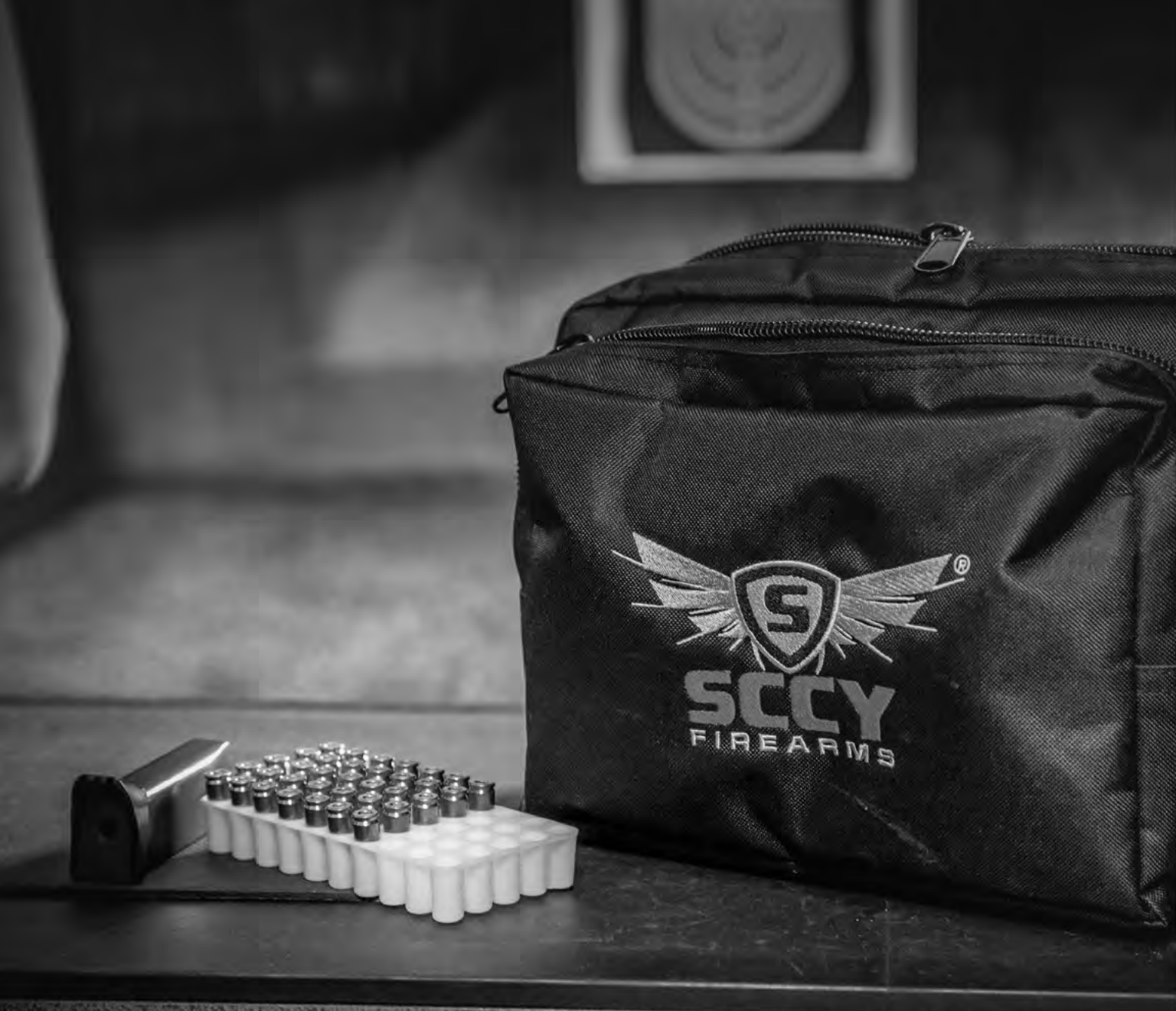
SCCY RANGE BAG